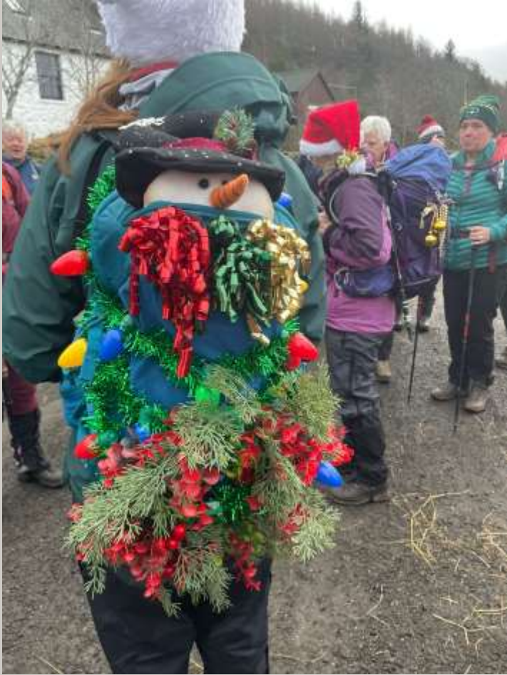
Best decorated rucksack