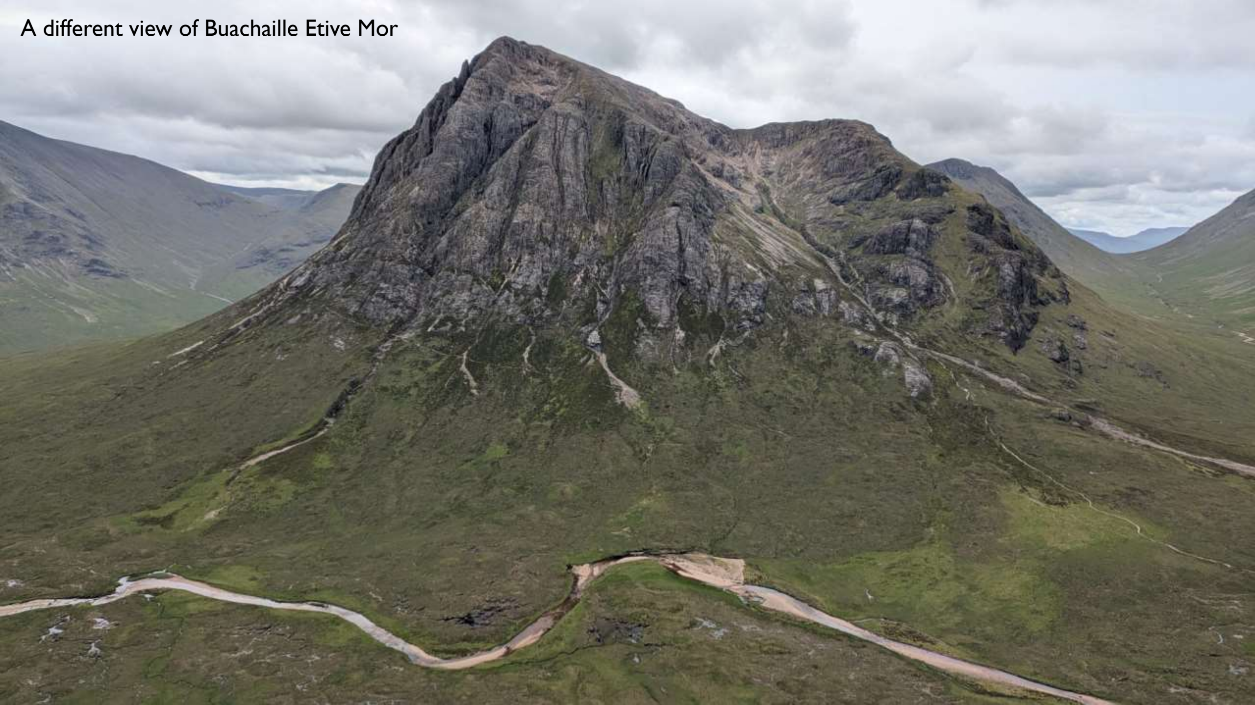
A different view of Buachaille Etive Mor