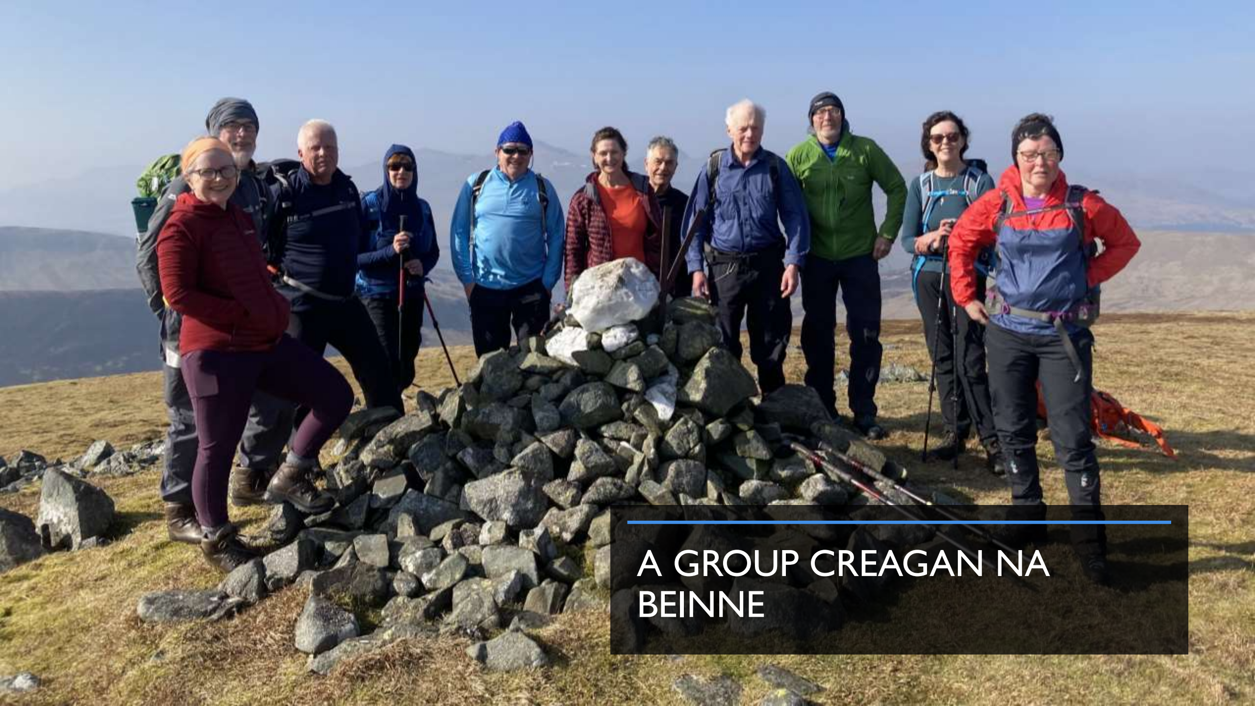
A GROUP CREAGAN NA BEINNE