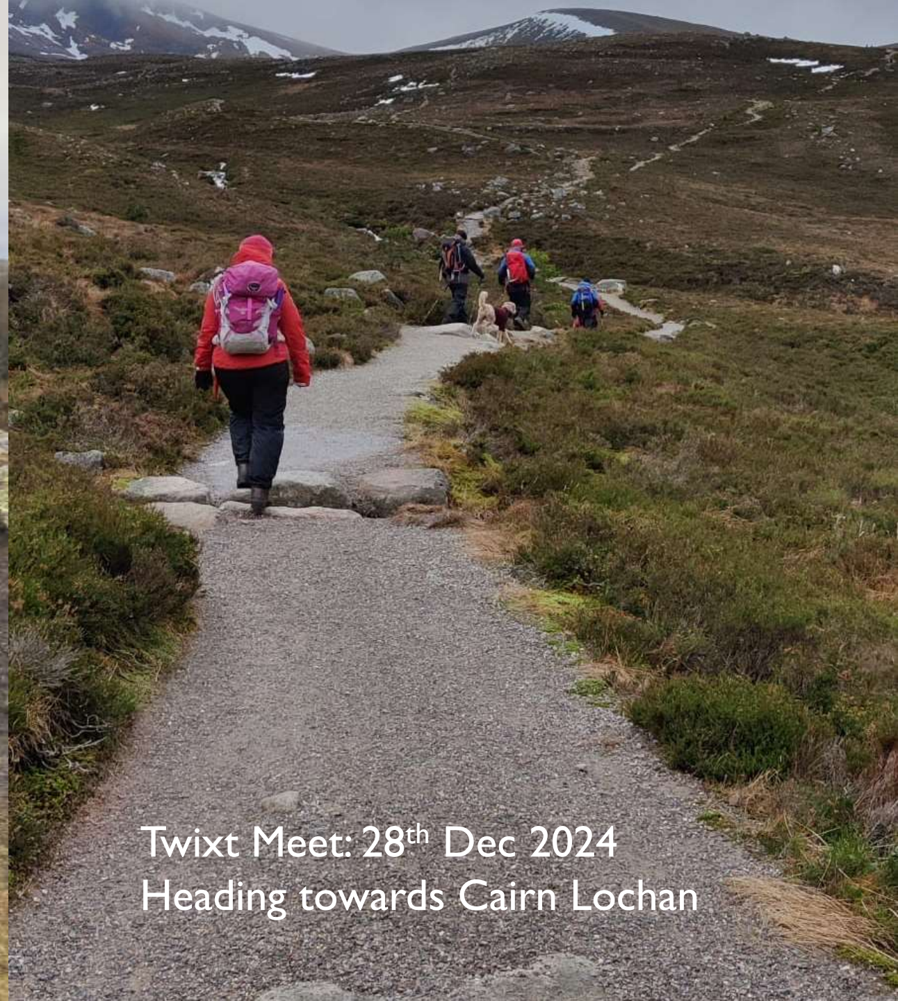
Twixt Meet: 28 th Dec 2024 Heading towards Cairn Lochan