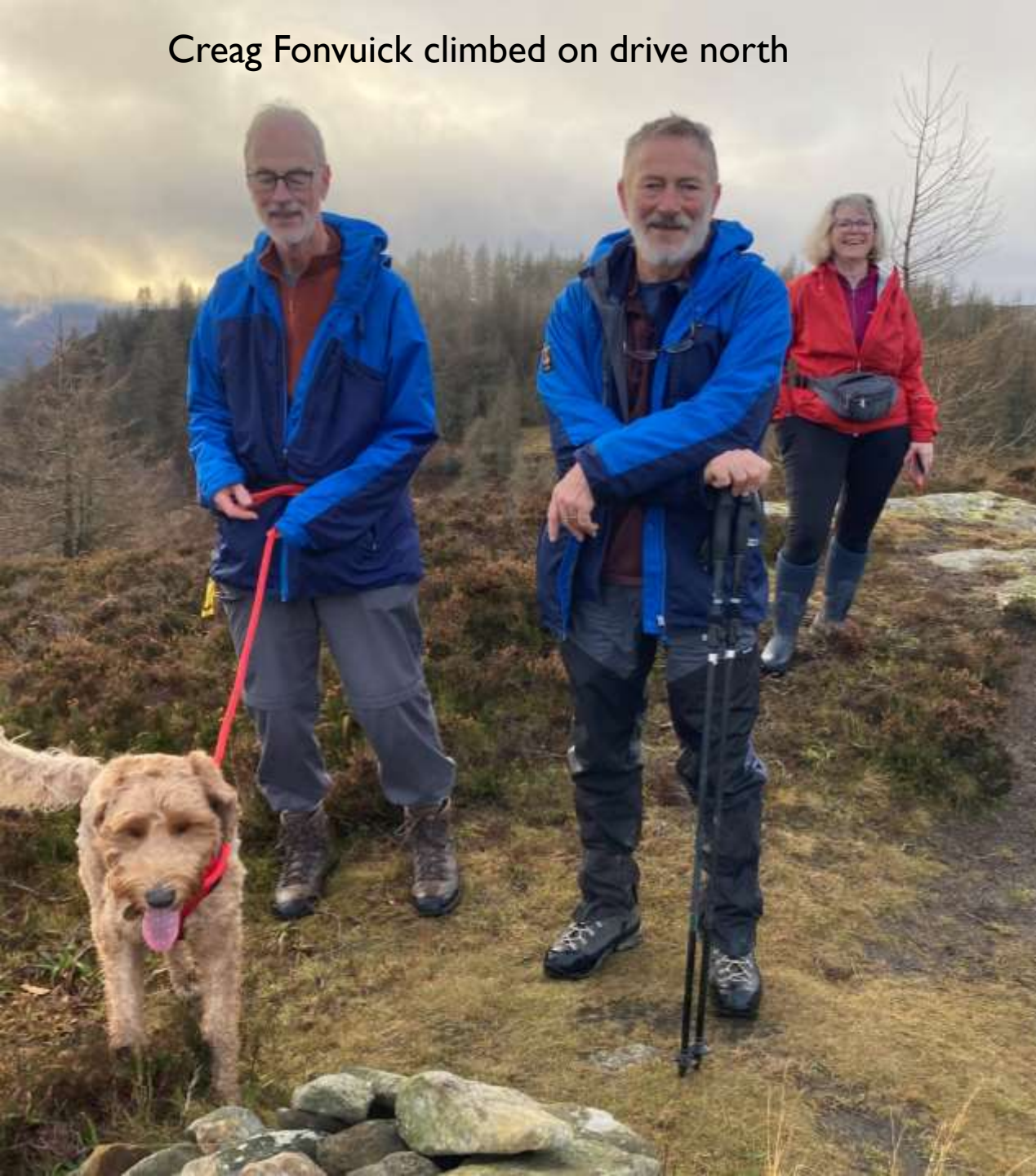
Creag Fonvuick climbed on drive north