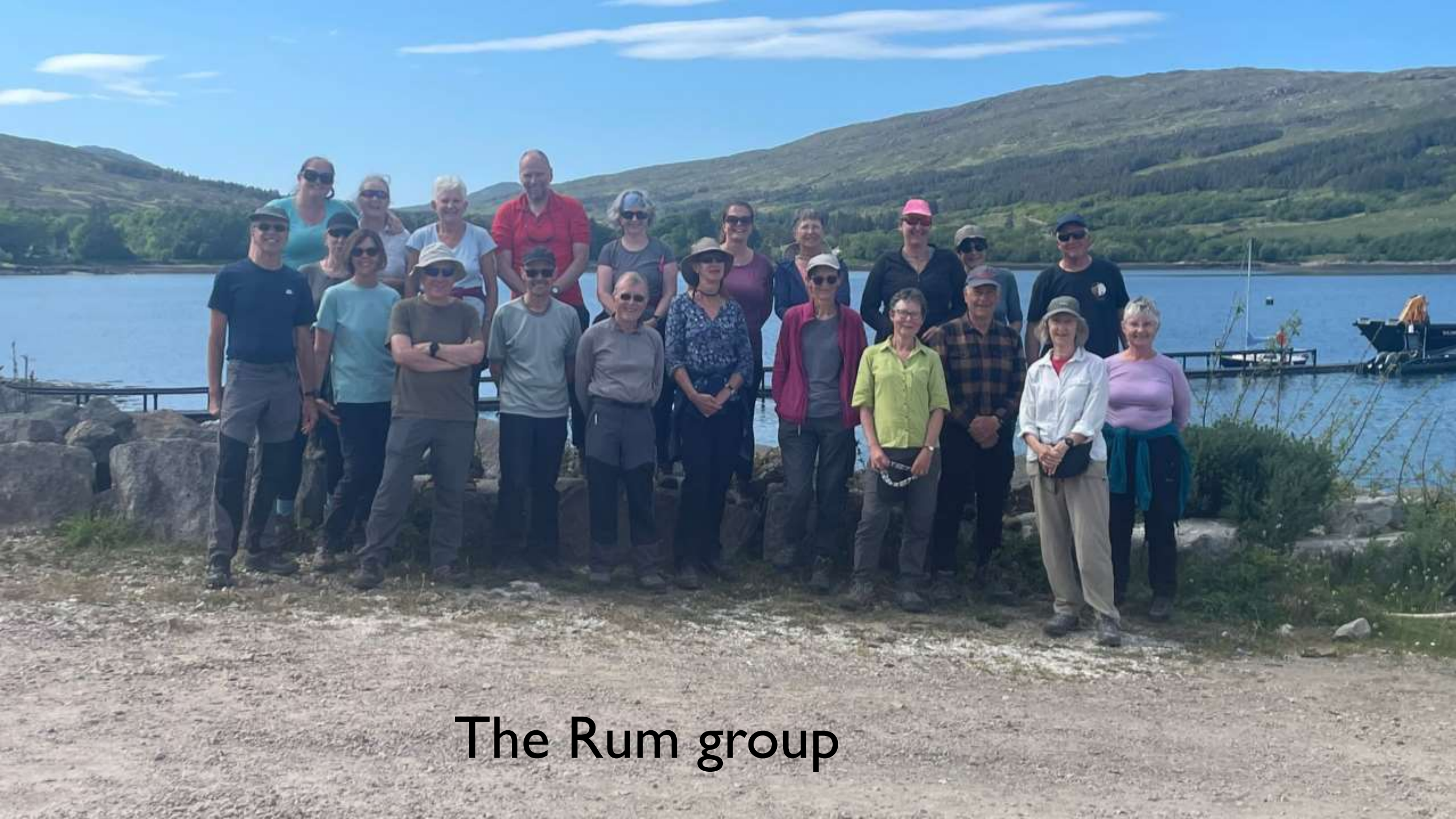
The Rum group